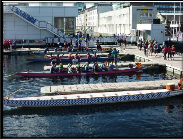
Boat Loading Area

The racing course is set within an enclosed dock area and measures just over 500m in length and circa 150m wide with a water depth of 4m – 5.5m. The water is non-tidal and does not have a flow. The start and finish will be marked on and off the water. All starts will be free standing starts.